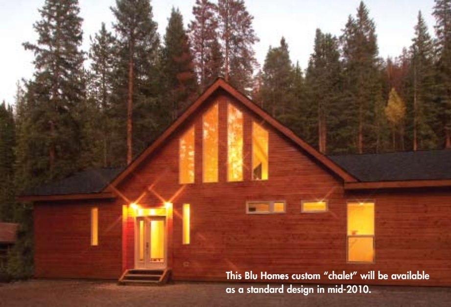
This Blu Homes custom "chalet" will be available as a standard design in mid-2010.