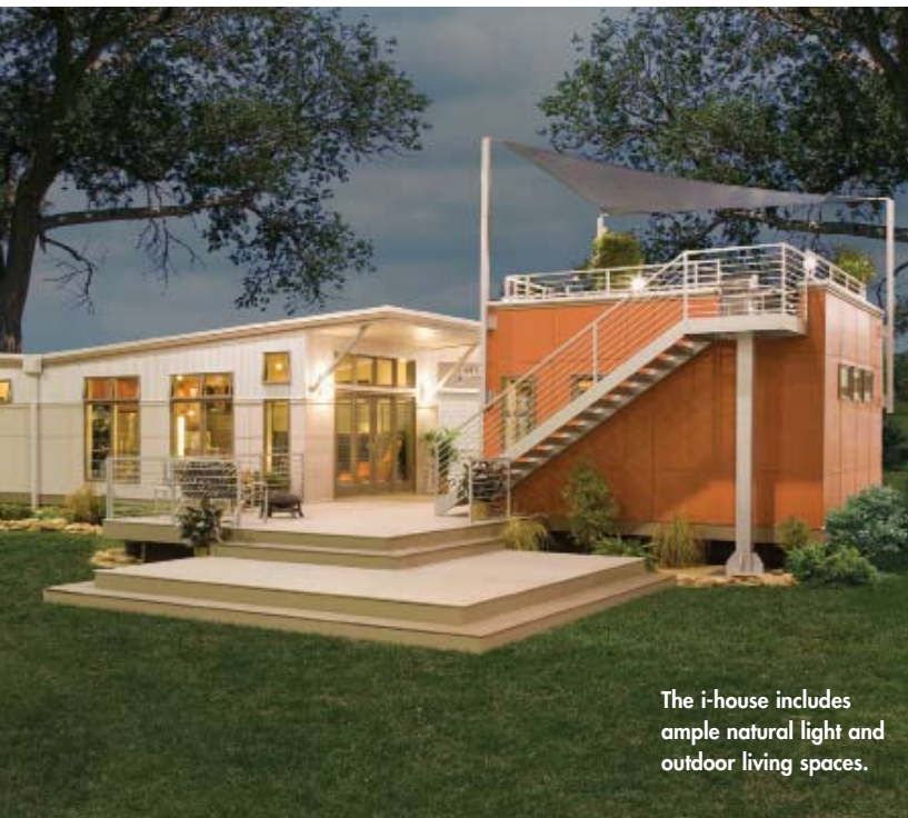
The i-house includes ample natural light and outdoor living spaces.

As more people become interested in sustainable living, more companies are offering small, low-cost green prefabricated homes—often ready to go up in days.