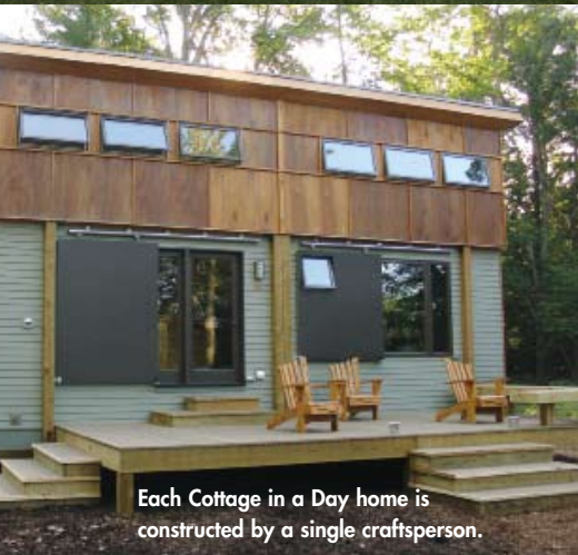
Each Cottage in a Day home is constructed by a single craftsman.

For more information, go to WWW.CLAYTONIHOUSE.COM or call (866) 516-1140.